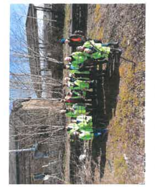
Penistone Clean and Tidy Team July 2016